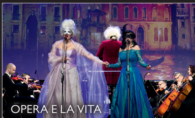
OPERA E LA VITA

14 February 2016, Sunday, 7.00 p.m. National Philharmonic hall, Warszawa